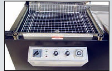
Dual Magnet Hold Down During Seal Cycle.

Now Available in 110 or 220 Volt For Higher Performance and Lower Operating Costs