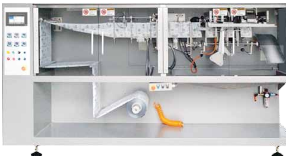
(Above) The H Series HFFS model H303