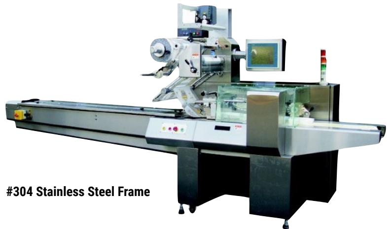
#304 Stainless Steel Frame