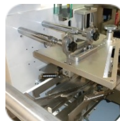
Adjustable Forming Box