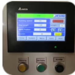
7" Color Touch-Screen HMI w/ 50 Program Memory