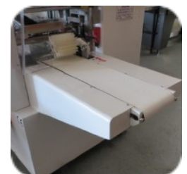
24" Long Discharge Conveyor