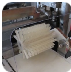
Discharge Brush Helps Separate Products