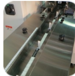
7ft. Flighted Infeed with Product Carriers