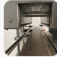
Consistent temperature and air distribution in full tunnel length