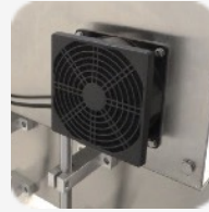
Cooling Fans Keep Tunnel Cool to the Touch