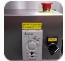
Variable Speed Conveyor with Emergency Stop Switch