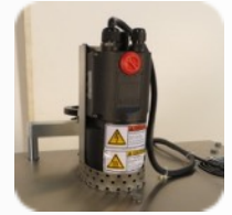
Adjustable Temperature Control