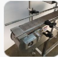
Plastic Top or Metal Conveyor Material Available