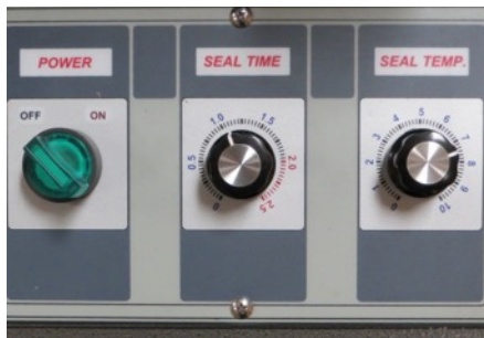
Independent Seal Time and Temperature Control.