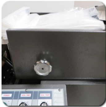
1. Load wicketed bags into machine.