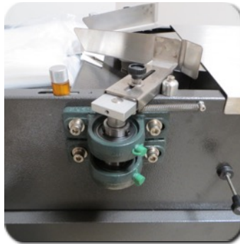
2. Adjust side guide for package size and bag width.