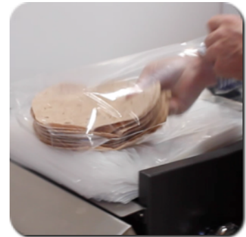
3. Load product into bag and push forward to tear bag from wicket