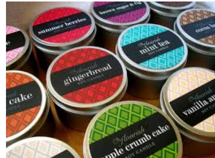
Example of top label application.