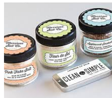
Example of top label application.

Built into all Preferred Pack® designed labeling machines is a cost effective solution to fast, reliable, pressure-sensitive top labeling for trays, boxes, chipboard containers, bags and even caps on bottles.