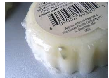
Example of bottom labeling

The PP-559 “BOTTOM ONLY” Label Applicator is a popular labeling system used in many industries and is ideally suited for a wide range of applications. The PP-559 is ruggedly constructed of # 304 Stainless Steel and uses state-of-the-art Delta Color Touch Screen HMI technology. Memory ports for 80 sizes of products delivers fast, always ready, easy to use “need it now” reliability when changeovers are required. Our pre-delivery inspection confirms proper set-up and functionality, ensuring every machine is set up to your specific application. This machine features a “Split Conveyor Belt Design” allowing for the label to be applied to the bottom of the container.