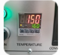
Digital Temp Control 0-400°F