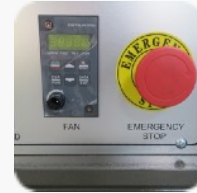
Variable Air Velocity Control and Emergency Stop Switch