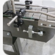
Stainless Steel Flat Top Belt with Adjustable Side Guides