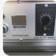
Variable Speed Conveyor