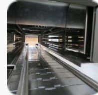
Infrared Heating Elements