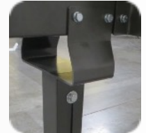
Adjustable Height Legs