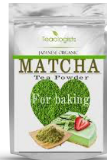
Example of bag label application.