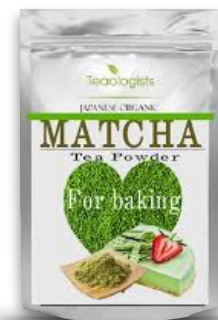
Example of bag label application.

Built into all Preferred Pack® designed labeling machines is a cost effective solution to fast, reliable, pressure-sensitive top labeling for bags.