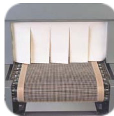
Teflon Mesh Belting