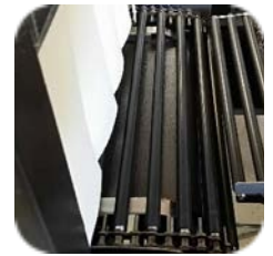
High Density Rollers - Close Roller Spacing 1/2" Gap