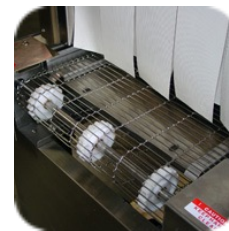
Stainless Steel Metal Mesh Belting