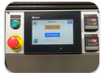
6" Color Touch-Screen with 40 Presets and Self Diagnostics

Reliability, simplicity and ease of maintenance should provide years of dependable performance at low operational cost. The PP-5600 CS is an extremely versatile machine capable of running a wide variety of industrial or consumer products. The PP-5600 CS features a Motorized Center Seal that allows for precise seam placement and taller package heights.