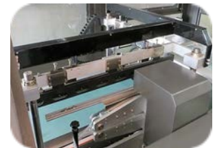
Vertical Seal Head with One Piece Seal Knife and Blade 2yr Warranty on Seal Blade