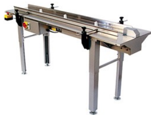
Optional 3' or 6' flighted or belted infeed conveyor