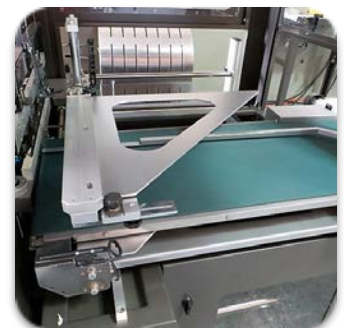
"APA" Automatic Product Size Adjustment of Inverting Triangle & Infeed Conveyor *Exclusive Feature!