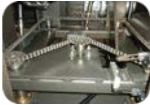
Motorized Adjustment of Seal Head No Crank Handles to Adjust