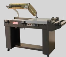
PP-1622HK Hot Knife Seal System Used with Polyethylene Films.