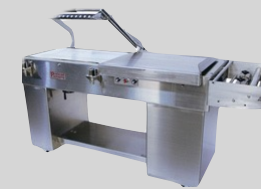
PP-1622MK-SS Stainless Steel Frame Construction.