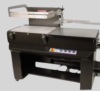
PP-1622MKA-V-PI Air Operated with Vertical Seal Head, Power Film Unwind and Adjustable Film Inverting Head. Great for feeding product inline.