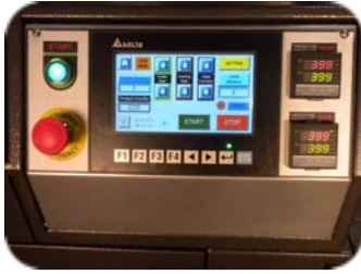
Delta PLC with 40 program memory and self-diagnostics