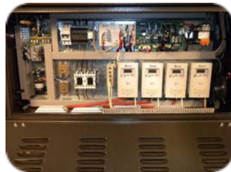
Easy access control panel