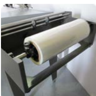
20" Film Cradle with Roll Brake