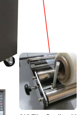
20" Film Cradle with Roll Brake and Roll Guide

The Preferred Pack Model PP-1622HK is a proven workhorse with thousands of machines in the field successfully running since 1993. Our 20 plus years of experience as the industry leader in manufacturing semi and fully automatic L'Sealers will give you the peace of mind knowing you have purchased the best machine available on the market today!