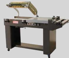
PP-2028HK Hot Knife Seal System Used with Polyethylene Films.