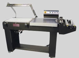
PP-2028W-A Air Operated Seal Head.