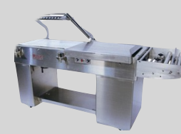
PP-2028W-SS Stainless Steel Frame Construction.