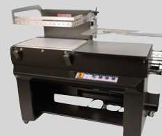
PP-2028WA-V-PI Air Operated with Vertical Seal Head, Power Film Unwind and Adjustable Film Inverting Head.